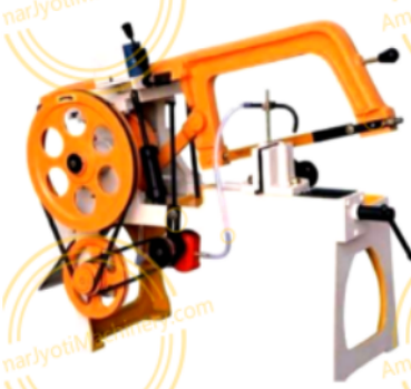
POWER HACKSAW AUTO CUT OFF