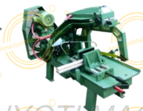
SEMI HYDRAULIC HACKSAW